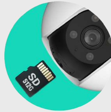
Supports MicroSD Card

You can secure your recorded videos on a local microSD card of up to 512 GB, or subscribe to EZVIZ CloudPlay for fully-encrypted cloud storage 1 .